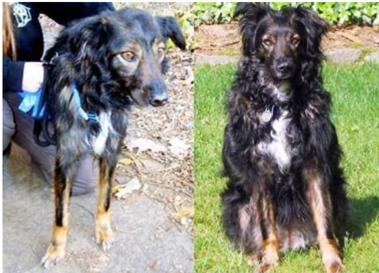
Same dog, new life